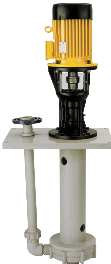
KG - KGS