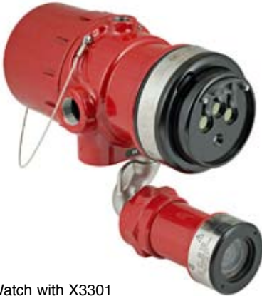
xWatch with X3301